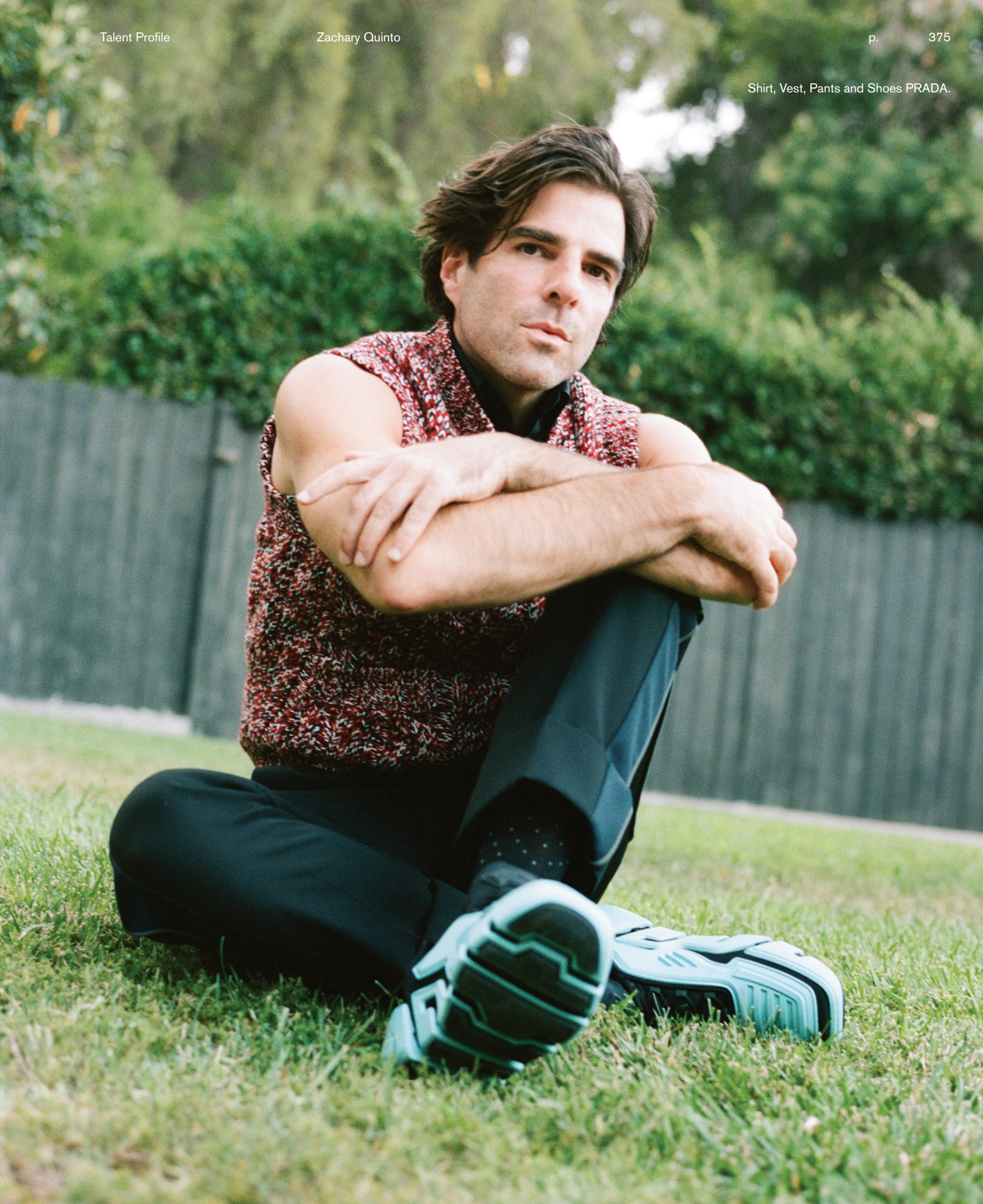
Shirt, Vest, Pants and Shoes PRADA.