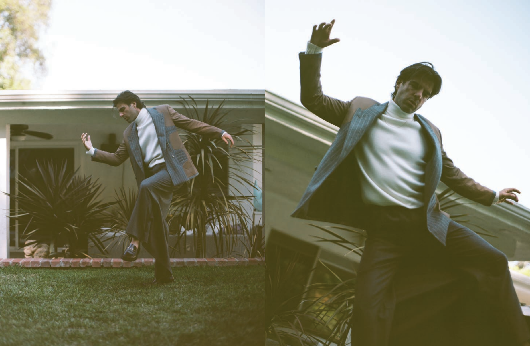
Shoes VERSACE, Necklace ZACHARY'S OWN, Jacket, Turtleneck and Pants FENDI.